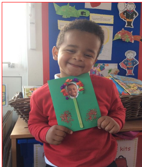
Expressive art and design