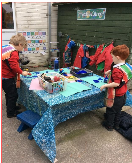
Outdoor Art Work