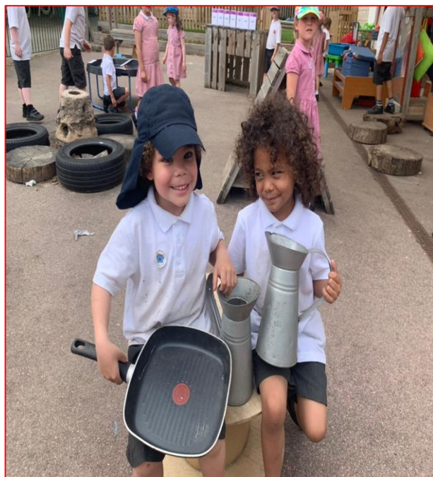
Communication and Language